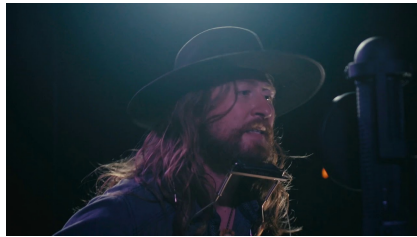
“WRITING ON THE WALL” – BY, NATHAN GRINER

(CLICK THE PICTURE. THE LINK WILL OPEN IN ANOTHER WINDOW)