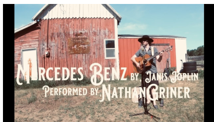
“MERCEDES BENZ (COVER)” – BY, JANIS JOPLIN